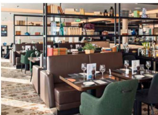
Target main restaurant